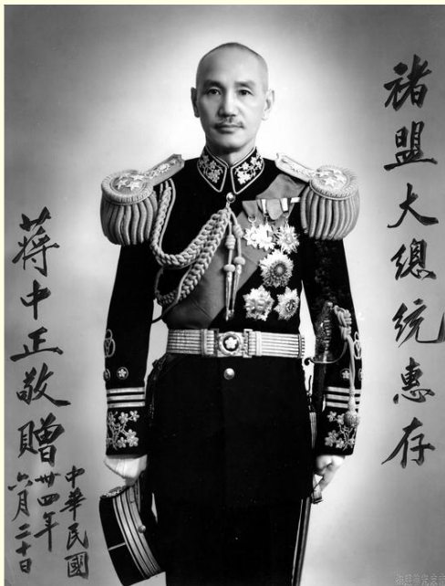
Chiang Kai Shek

www.wikipedia.com has extensive details of the Chinese Civil War's campaigns 1926-1949 and several orbats.